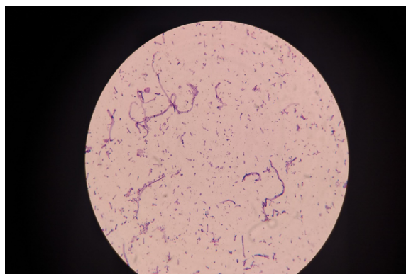
Figure 1. Gram-positive bacilli of B. bifidum in de Man Rogosa and Sharpe broth