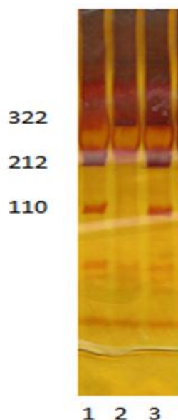
Figure 1. Polyacrylamide gel electrophoresis after polymerase chain reaction–restriction (CYP2C19*2). Line1: Normal fragment (110, 212), Line 2: Mutant fragment (322, homozygous), Line 3: Mutant fragment (110, 212, 322 heterozygous).

The frequencies of wild type (*1/*1), mutated heterozygous (*2/*3, *1/*2, *1/*3) and mutated homozygous (*2/*2, *3/*3) were evaluated as 72.7% (112 cases), 23.4% (36 cases) and 3.9% (6 cases), respectively (Figure 2). Clinical resistance to clopidogrel was observed in 20 patients (83.3%) with wild genotype and four patients (16.7%) with mutated heterozygous cases (Figure 1).